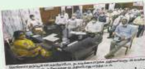
கொரோனா தடுப்பூசி 100 சதவீதம் போட நடவடிக்கை

அதிகாரிகளுக்கு, தமிழக அரசுத்தரவுகள் உத்தரவு